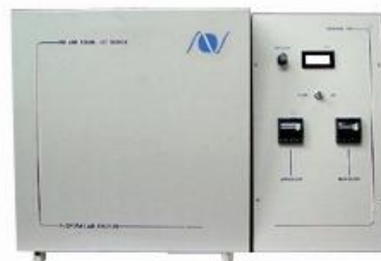
AIR/STEAM JET CLASSIC REF. 941303