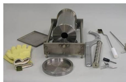
Kit of accessories delivered with NRC 210