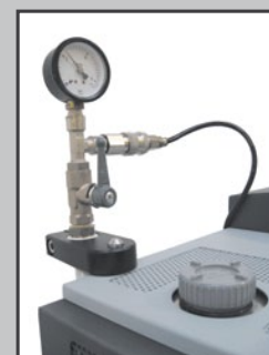
Automatic N 2 Fire Extinguisher