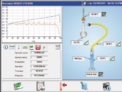
Friendly & Professional Software